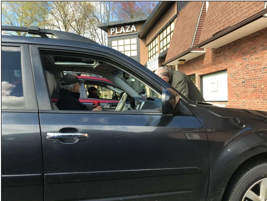
Larry AB1JC, Dave KB1LTW and Ken NE1CU. Gary WE1M was the shutterbug.

We have officially albeit temporarily canceled breakfasts until further notice. Below is a picture of our recent test of a “social-distancing” at the Plaza Diner in Shelton. We decided to test the idea of a “social-distancing” breakfast, where we purchase breakfast and have it delivered curb side and all eat in our cars. This makes breakfast very awkward, and it is still questionable whether this is viable for breakfast. Perhaps breakfast will become easier once the state relaxes its mandates.